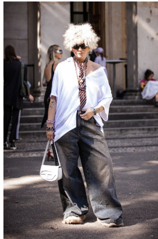
Frontal Full Outfit