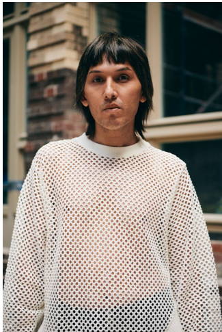
Close Up Beauty